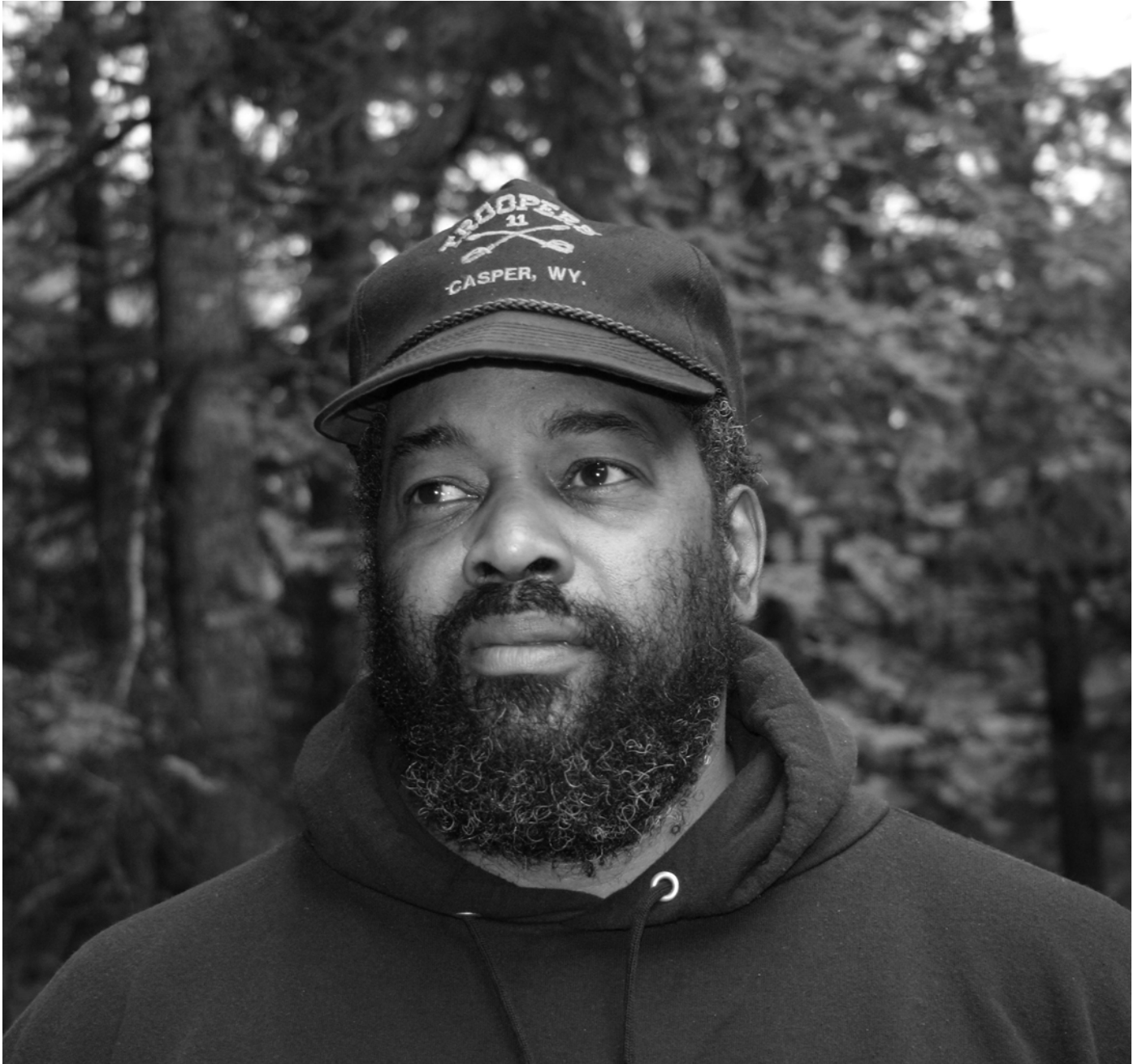
Photo of the Author